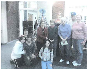
Lions Tree at the Library

I hope every one had a Happy Thanksgiving